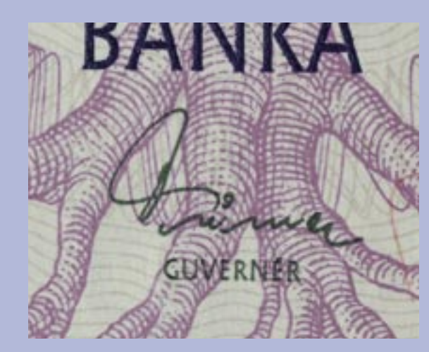
Governor's signature "Tůma"