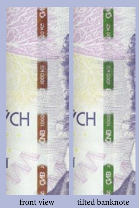
metallic security windowed thread changes colour from puce to green when tilted