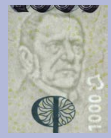
the watermark with a portrait of František Palacký visible against the light now also contains the number 1000 with a linden leaf