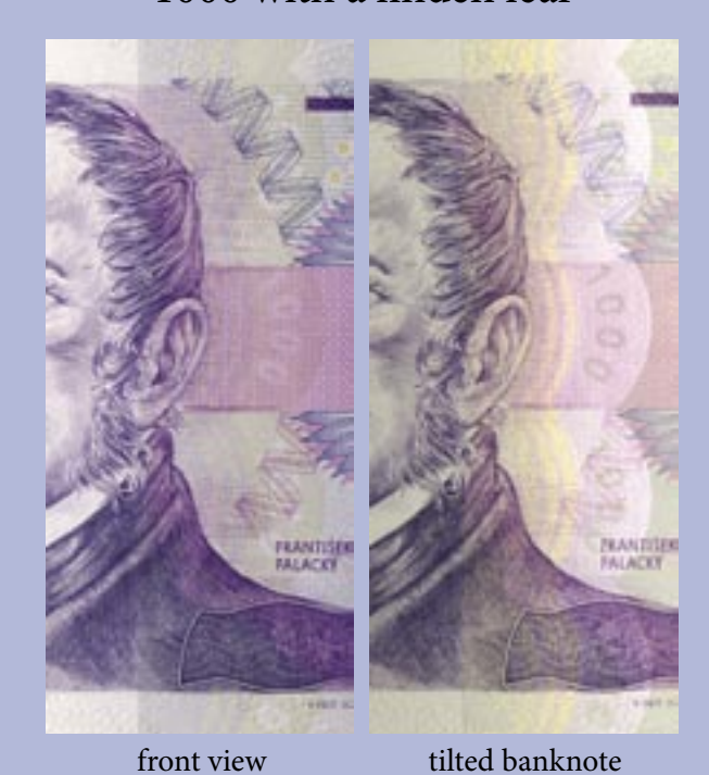
bichrome patterned iridescent metallic strip of overlapping gold and purple with recurring negative 1000s